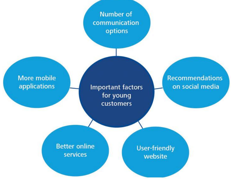
Figure 3. Factors of Yourn consumers for CB

Further, we incorporated additional constructs (moral attitude, health consciousness, and environmental concern) in the TPB who measured its appropriateness in Indian surrounding. Combining both - young generation and extended model of TPB bring crucial infor- mation which can potentially be used not only as a basis for further research but will also be useful for organizations with a practical interest in the production, sale and dis- tribution of organic food.