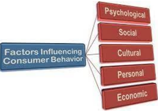
Figure 1. Factors affecting Consumer Behaviour

and a recent report from the TechSci Research company gave a positive outlook for the future Arshi (2021). In order to respond adequate-ly to these changes, it is important to understand the factors influencing the behaviour of consumers when purchasing organic food, both for the retailer and producer, as well as for politicians involved in ecological farming.