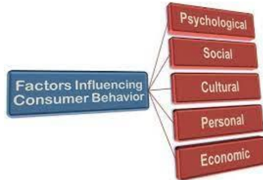
Figure 1. Factors affecting Consumer Behaviour